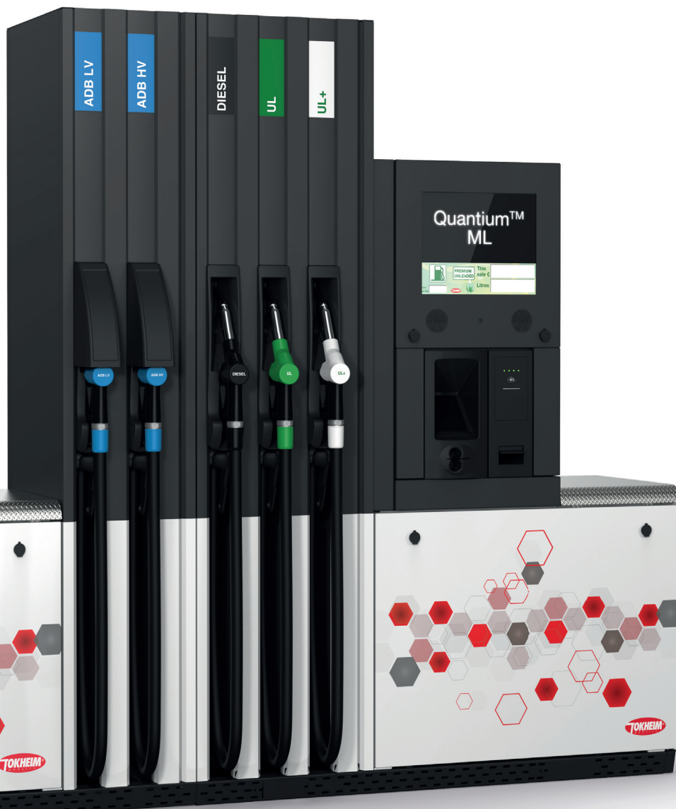
Tokheim Quantum™ ML AdBlue® dispenser

The highly configurable Quantum ML AdBlue® dispenser is here to meet the fueling demands of today and tomorrow. Thanks to our trusted Tokheim quality delivering reliable operation, this dispenser delivers lower total cost of ownership (TCO), has greater uptime than other pumps on the market, thanks to a reduced need for maintenance intervention.