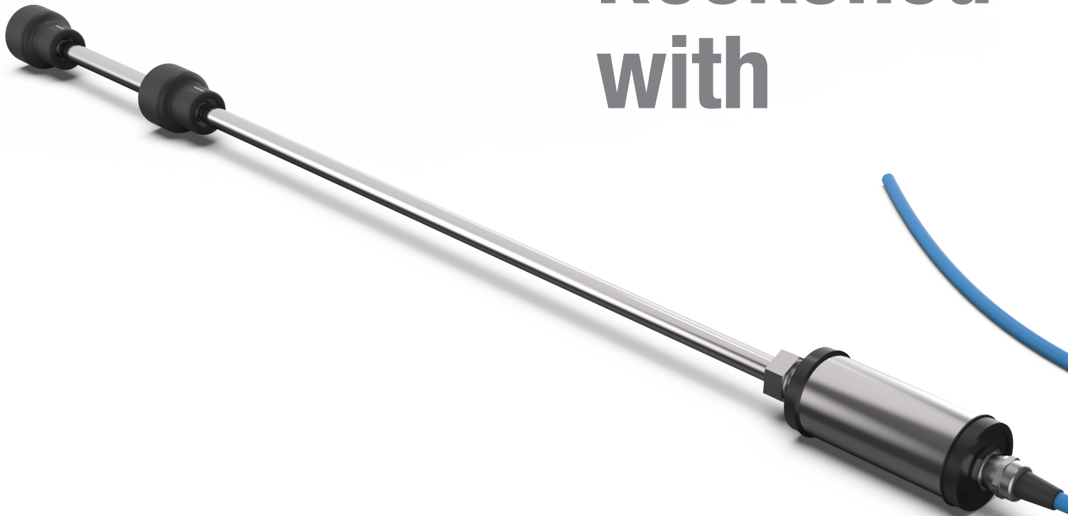
DFS DMP Magnetostrictive Probe (s)